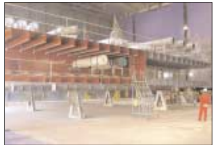
Hempel's HEMPADUR UNIQ 4774 is applied at Daewoo Shipbuilding and Marine Engineering, Korea, on a 115,000 tdw crude oil tanker being built for Teekay Shipping

Consequently, anti-abrasion resistance can be achieved by both pure and modified epoxy.