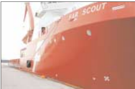
Farstad Shipping's vessel The 'Far Scout' with topsides and superstructure coated with IMC's Interfine 979 and Intershield 300 - excellent condition after 8 months service

The idea came from the observation that the area under a vinyl logo was much better preserved than other areas of the hull.