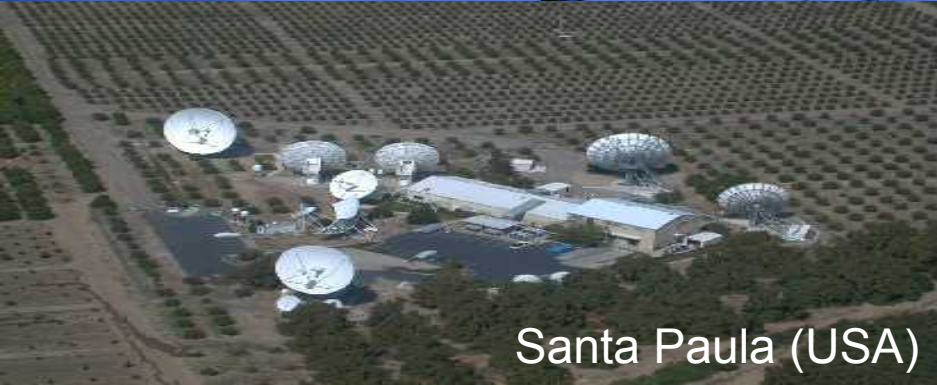
Santa Paula (USA)