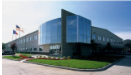
CapRock Global HQ – Houston, Texas