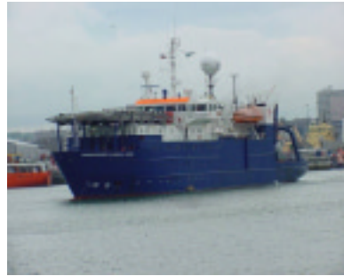
SubSea7 vessel equipped with CapRock system